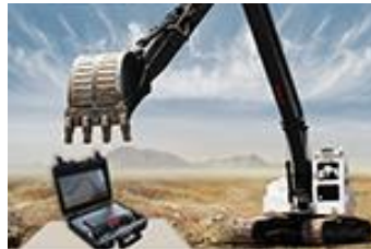
Remote-controlled Armoured Excavator