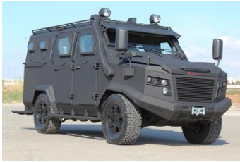
KHAN 4x4 Armoured Personnel Carrier