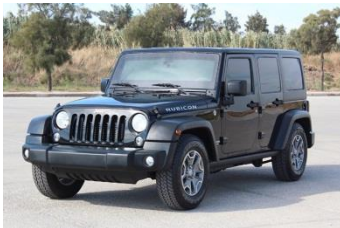
Nefer 4x4 Armoured Command and Patrol Vehicle