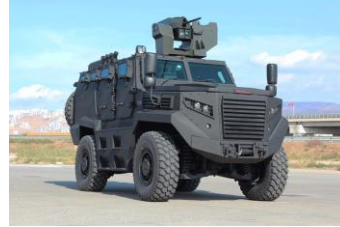
Hizir 4x4 Tactical Wheeled Armoured Vehicle