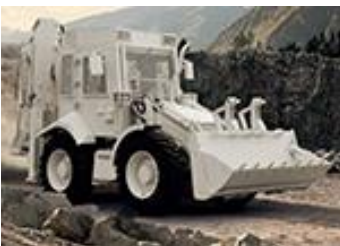
Armoured Construction Equipment